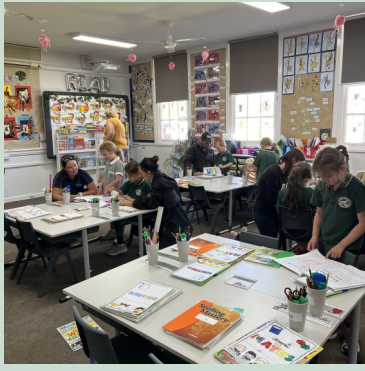
Hyden Primary School Naughton Street Hyden WA 6359

Phone: 08 96840800 E-mail: hyden.ps@education.wa.edu.au